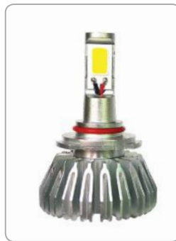
SEL-9005 / SEL-9006