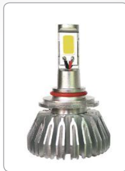
SEL-H8 / SEL-H9 SEL-H11