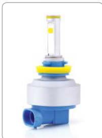
OPT-H8 / OPT-H9 OPT-H11