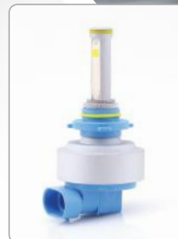
OPT-9005 / OPT-9006

3,000 lumen emitting diode capable of generating up to 3X the light of typical halogen headlamp.