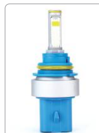
OPT-9004 / OPT-9007

5,000hr/3-5 years expected lifetime, surpassing 2-3 year lifespan of typical halogen headlamp.