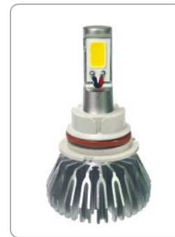
SEL-9004 / SEL-9007